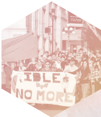
UPPER: Idle no more protesters marching along Government Street on December 21, 2012 LOWER: BLM Toronto Action Against Islamophobia

the field, this powerful new model becomes extremely relevant to those working for social change and to those funding such work. It is our hope that the analysis and recommendations in this report will enable accelerated implementation of best campaigning practices by progressive movements of all sizes.