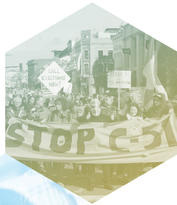
LEFT: LeadNow Canada — Victoria, BC protest BOTTOM: Idle No More, Vancouver, BC — December 21, 2012

that successfully fought to stop Keystone XL in the U.S. and the tar sands in Canada ended up including groups as diverse as Native Americans (First Nations in Canada) and ranchers, united by common concerns. Large intersectional networks are also being built by the climate movement, through the larger notion of “climate justice” and the #FightFor15, which has found common ground with the Occupy Wall Street and U.S. Black Lives Matter movements.