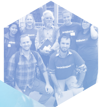
RIGHT: Sept. 12, 2015 — the Leadnow team with David Suzuki, about to hit the streets in London North Centre BOTTOM: Idle No More, Vancouver, BC — December 21, 2012

Elsewhere: 350.org, an organization that runs several global campaigns on climate change in 188 countries, allows its local chapters to manage their own identities, messaging and content. Freedom to customize and build distinct local identities is also enabled by the #FightFor15 and the global network of Hollaback! chapters